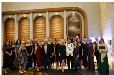
WA Health Excellence Awards 2025 winners - NMHS