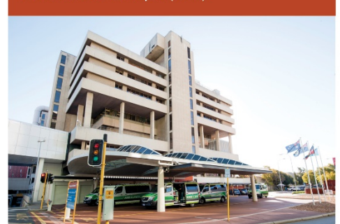
Sir Charles Gairdner Hospital (SCGH)

SCGH opened in 1958. The hospital treated 177,436 patients and provided 443,454 outpatient appointments this year.